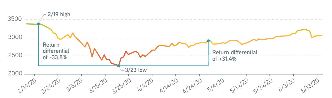
Figure 2: S&P 500® Index total return, 2/15/2020-6/13/2020

February and March 2020 brought new volatility to the markets as realization that the coronavirus would permeate the US took hold. By March 23, the S&P 500® had fallen approximately 34% from its peak in February in only 23 trading days. In addition, most markets experienced a significant decline in liquidity, which made physical rebalancing difficult and costly. While market participants debated whether the economic recovery would be V-shaped or prolonged, March 23 proved to be the low point for the S&P 500® in 2020 as the index advanced 30% over the next 27 trading days, later hitting new highs by late August.