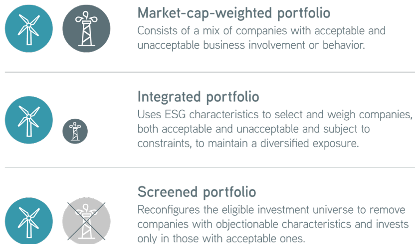
Figure 1: Screen versus integration

The other key difference between screens and integration is how separate ESG characteristics are handled. In a screened approach, these can easily be addressed through separate screens with specific criteria for each. But it’s more practical in integration to combine multiple ESG metrics of interest into a single composite variable that the investor can try to maximize while controlling for overall portfolio risk characteristics. This requires very careful consideration about how to create the composite metric and how it will interact with the other balancing risk characteristics. This multifaceted process can lead to undesirable outcomes if it isn’t understood or managed well.