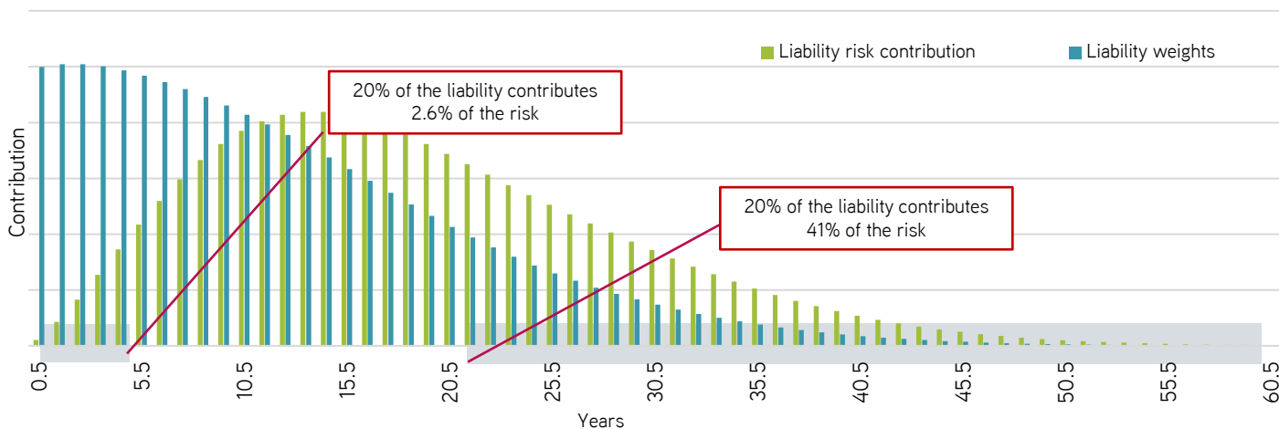
Hypothetical example: Liability contribution to risk by cash flow 1

Parametric’s analytics platform is designed to highlight key pension risks to help achieve the plan’s objectives. Parametric thoughtfully analyzes projected benefit cash flows to deconstruct liability risk.